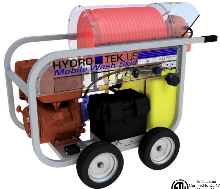
Shown with optional stainless steel frame